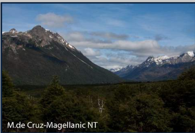
M.de Cruz-Magellanic NT

Our focus is on helping you capture exceptional images of wildlife and landscapes. This tour is designed to discover the valleys, peat bogs, lakes, and wildlife of hidden Lake. This tour is designed for active photographers who joined the pleasure of walking on the mountain and capture photo.