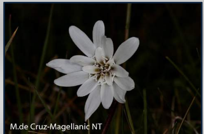
M.de Cruz-Magellanic NT

The Garibaldi Pass (430 mts over the sea level); the guide will explain the behavior of wildlife. After we will cross the Mountain range of the Andes, we will arrive at a panoramic view of the Lakes Escondido and Fagnano. It is an opportunity for macro and wildlife photography. We continue to Lago Escondido.