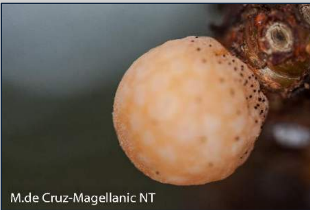
M.de Cruz-Magellanic NT

After cross Olivia's River we border homonym mount to realize our first stop in the viewing-point of Carbajal valley where we will appreciate the immensity of the place, the relief and the glaciers formations.