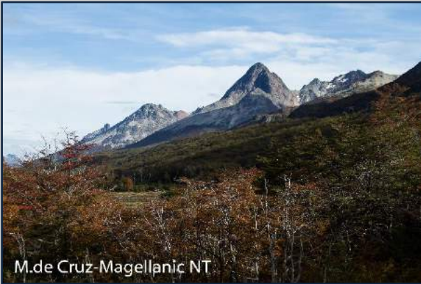
M.de Cruz-Magellanic NT

After cross Olivia's River we border homonym mount to realize our first stop in the viewing-point of Carbajal valley where we will appreciate the immensity of the place, the relief and the glaciers formations.