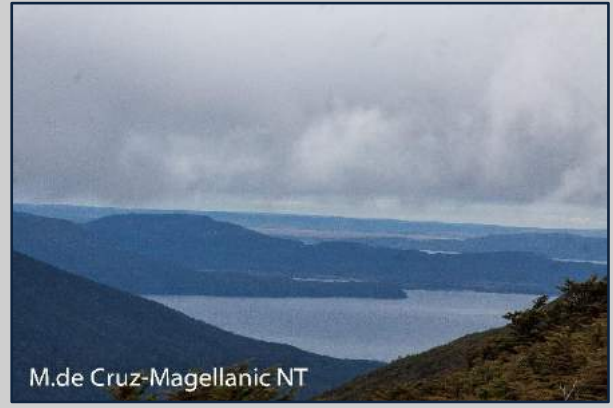
M.de Cruz-Magellanic NT

We continue the trip, visiting some mountain refuge to do some activities like sleds dogs (during the winter) or some trekking in summer.