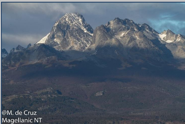
@M. de Cruz Magellanic NT

The Tierra del Fuego National Park will offer us one option to discover the subantarctic beech forest with the different ecosystem and the only National Park in Argentina where you can find the forest in contact with sea.