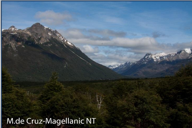
M.de Cruz-Magellanic NT

Our focus is on helping you capture exceptional images of wildlife and landscapes. This tour is designed to discover the valleys, peat bogs, lakes, and wildlife of hidden Lake. This tour is designed for active photographers who joined the pleasure of walking on the mountain.