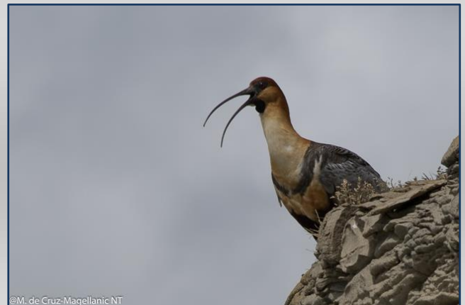
@M. de Cruz-Magellanic NT

Our Tour highlights Tierra del Fuego’s tremendous range of ecosystems: City of Ushuaia with view of the Beagle Channel, hanging glacier valleys, peat bogs, Lakes, the particular village of Tolhuin, steppe, Fuegian Ranches and the Atlantic Ocean with historic ship abandoned. The tour is in focus of the different ecosystems of Tierra del Fuego where you can capture photos with telephoto, macro, zoom, all your photographic equipment ready to enjoy the landscapes, birds, mammals, human settlements, etc.