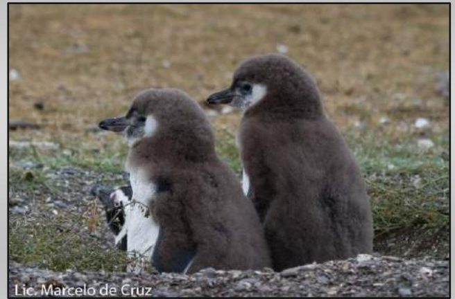
Lic. Marcelo de Cruz

We start our tour from the tourist pear crossing Ushuaia's wide bay until reaching the Beagle Channel across Paso Chico. There we sail around Isla de los Pájaros and Isla de los Lobos. Both islands belong to the Archipelago Bridges. When come to the Les Eclaireurs Lighthouse, we will be able to see the colonies of imperial Shag and Rock Shag.